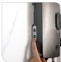
Safe with ELCB (Earth Leaking Circuit Breaker)