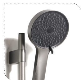
Luxurious 5 shower functions