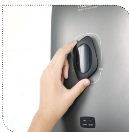
Stepless control temperature