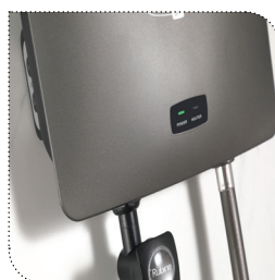
Trendy gunmetal colour