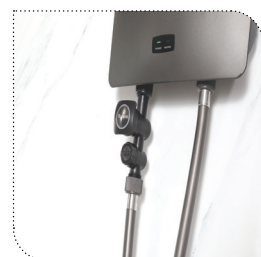
3-in-1 compact valve