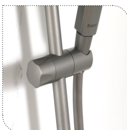
Adjustable handshower holder