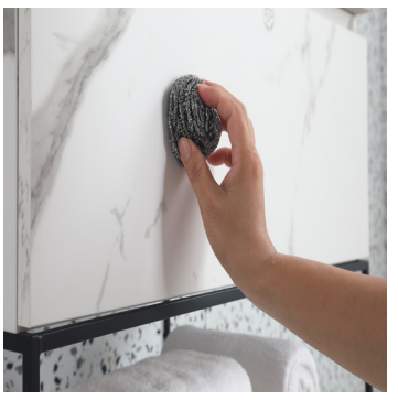
Stain resistant and easy to clean