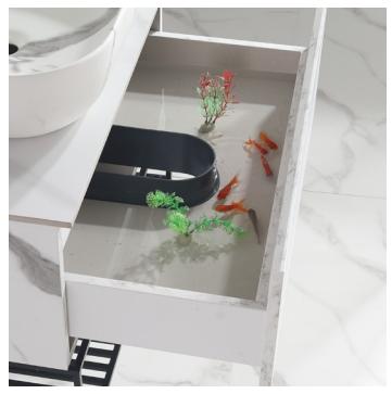
Ligthweight & waterproof