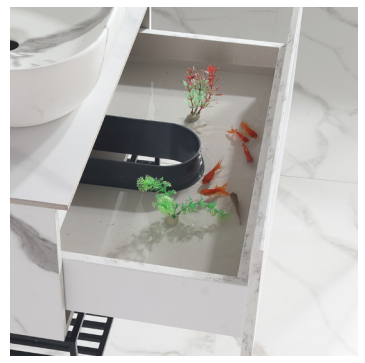
Ligthweight & waterproof