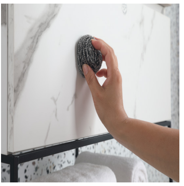
Stain resistant and easy to clean