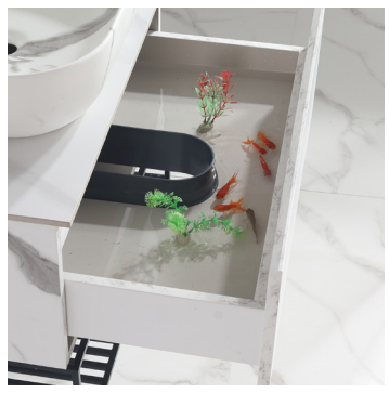
Ligthweight & waterproof