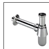
CBA-203-BT2/CH Brass bottle trap Chrome