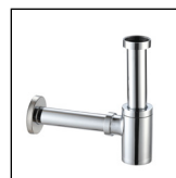
CBA-203-BT1/CH Brass bottle trap Chrome