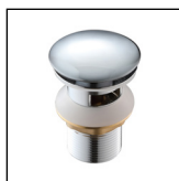
CBA-202CH Chrome waste with overflow