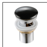
CBA-202CR/B Ceramic waste Black with overflow