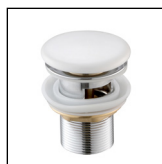
CBA-202CR/W Ceramic waste White with overflow