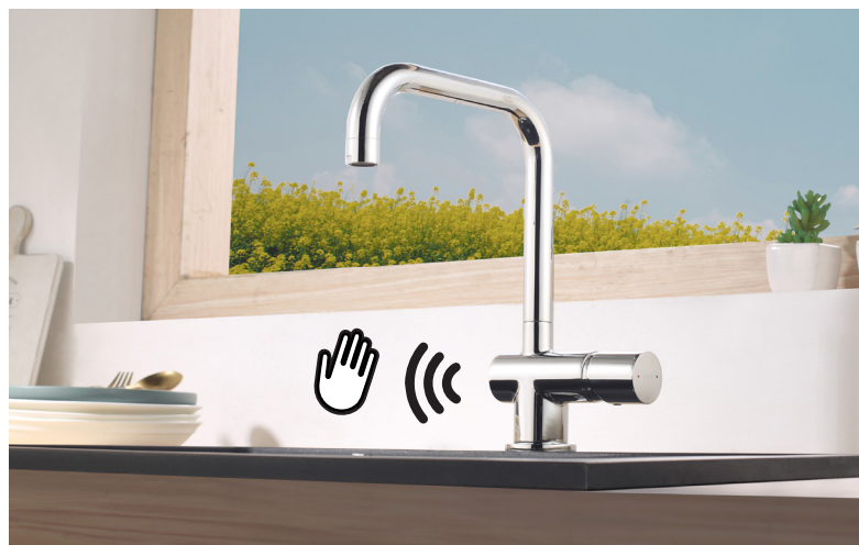
Able to control via sensor or manual.