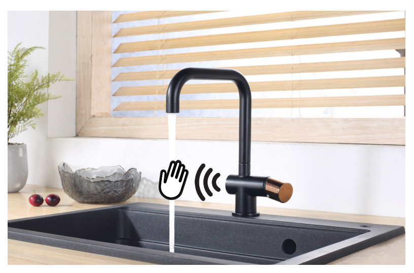
Able to control via sensor or manual.

The Two Towers is the most prominent tower in Bologna city, Italy. Built-in the 12th Century by two powerful families, Asinelli and Garisenda; and its marvelous design has also initiated the birth of the Rubine BO series thru our inhouse design team. Slender and in cylindrical shape like a tall tower reaching the sky is a perfect balance between a modern design and shape. The BO (BOlogna) series is in line with the latest color trend in particular the use of 2-tone like Black and Rose Gold, and an electroplated finishing also ensures better surface coating and greater abrasion resistance, and daily wear and tear. The shape, design, and choice of colors making this series versatile and adaptable to differ-