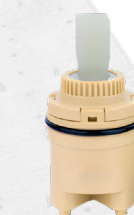
26mm upper-sealed, high bottom cartridge

Material Surface Finishing Colour Water Connection Type Of Cartridge Water Efficiency Water Consumption PUB Reg No. Package Included Warranty (T&C's Apply)