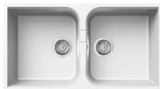
Pearl White (WH)