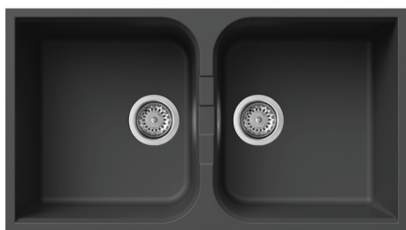
Pearl Black (PB)