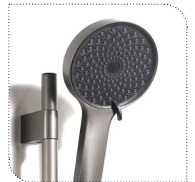
Luxurious 5 shower functions