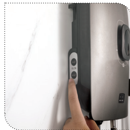
Safe with ELCB (Earth Leaking Circuit Breaker)