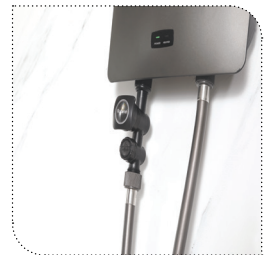
3-in-1 compact valve