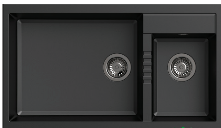
Pearl Black (PB)