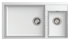
Pearl White (WH)