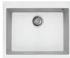
Pearl White (WH)