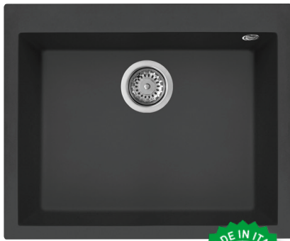
Pearl Black (PB)